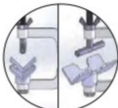
Dual Position Bottom Bracket.

Pipe Pliers are the convenient way to hold round pipes for: BUTT-WELDING and CROSS JOINTS .