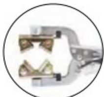
PG622V PG634V PG114V

* Magnetic V-Pads and Stainless Steel V-Pads (Part No. XFVS) also available separately. See page 49 for details.