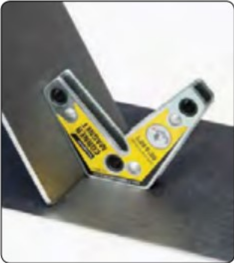
Use the outer edges of the Corner Magnet to hold stock at 120°.