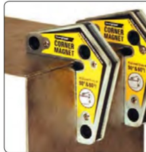
The compact and low profile Corner Magnet is ideal for light duty holding of stock.